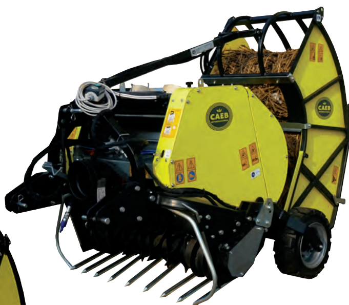
QUICKPOWER 1230 + Bale Transporter 4CM