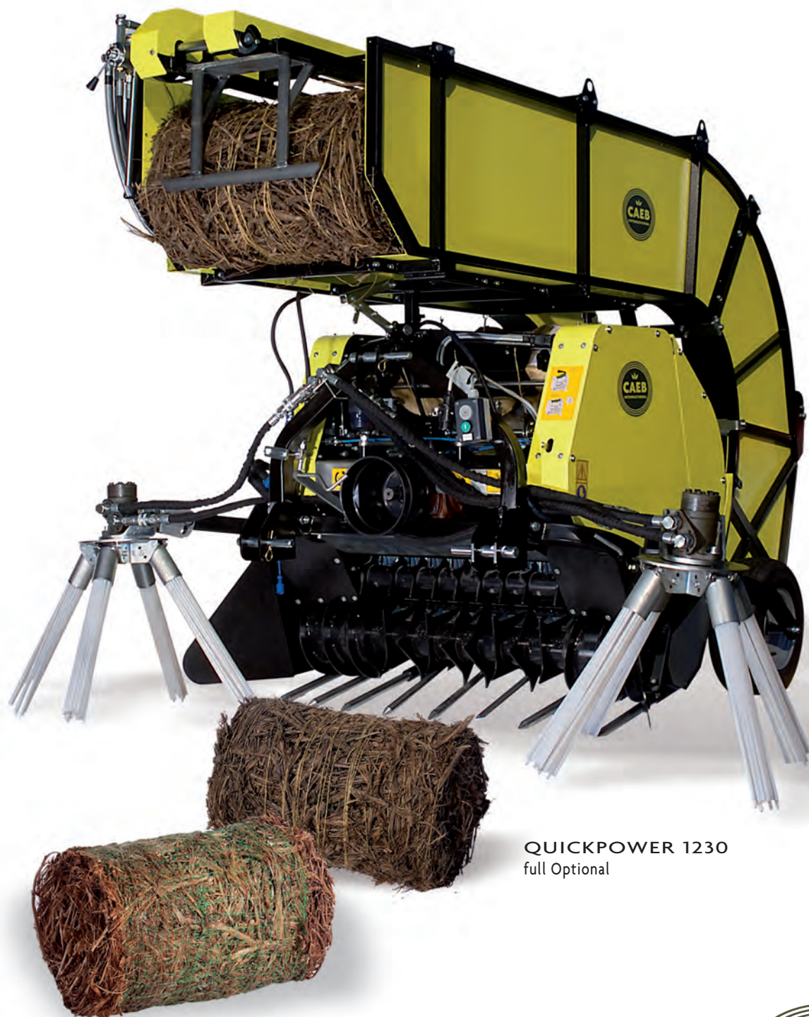
QUICKPOWER 1230 full Optional

ROUND-BALER FOR VINEYARD PRUNINGS AND TRIMMINGS