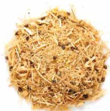
veal TMR straw

Use of various total mixed rations, for example in the Gollhammer veal farming operation (Upper Austria): Since using the „PROFI MIX“ feed mixer, it has been possible to reduce the average fattening period of the feeders by approx. 20 days and increase the daily weight gain per animal by 150 g.