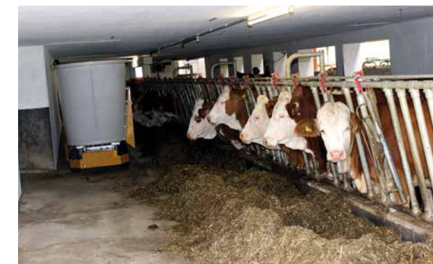
With a volume of 1.5 m 3 and its low overall height, the small "Distributor 1.5 SFB" distribution wagon is ideally suited for driving into low farm buildings.

For operations with low farm buildings, this combination of stationary feed mixer and distribution wagon offers a cost-effective alternative to fully automatic feed systems. Here, the advantage clearly lies in the flexibility and effectiveness: Thanks to the compact construction of the distribution wagon, all sheds are accessible. The TMR station assures the efficiency and rapid availability of individual mixes.