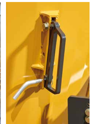
A second counter-cutter is available for use with feed with a high raw fibre content.