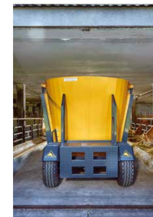
With a standard height of 2.07 m, even low shed accesses pose no problem.