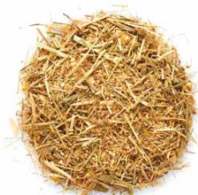
veal TMR hay

barley straw barley wheat soy minerals buckwheat milk powder molasses