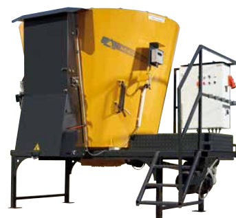
Stationary mixer PM 4.0 ST