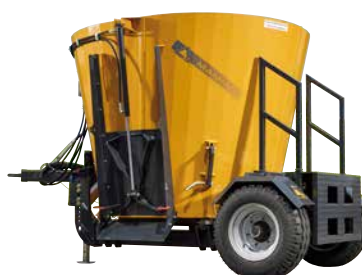
Trailer mixer PM 4.0 A