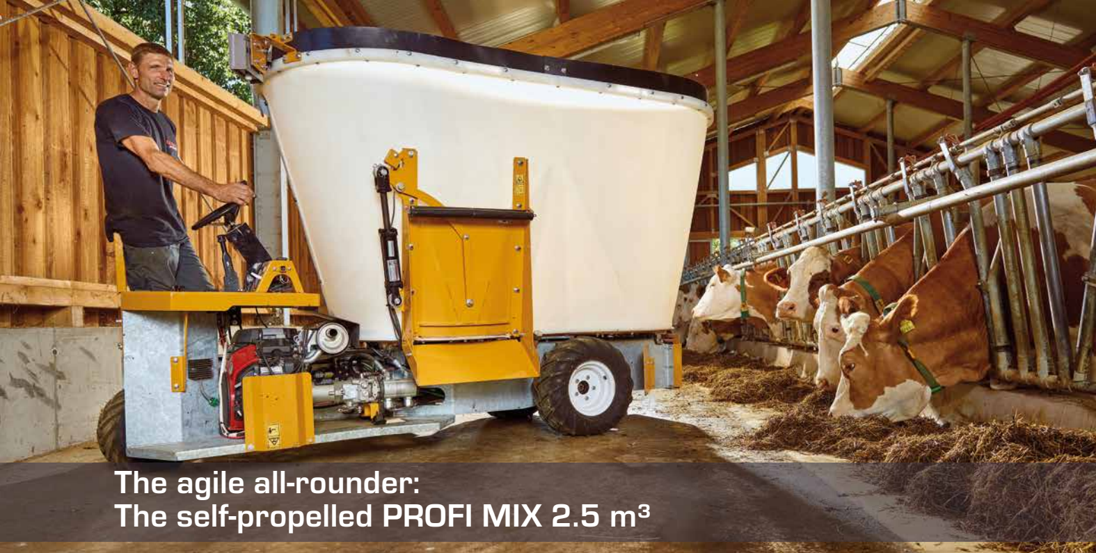
The agile all-rounder: The self-propelled PROFI MIX 2.5 m 3