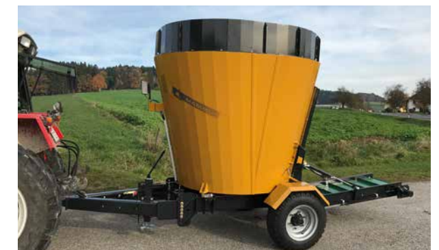
It is also possible to adapt the individual feed mixer to suit individual wishes.