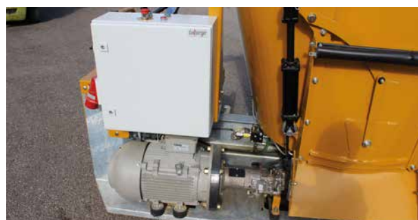
Emission-free use inside sheds is also possible with the 15 kW electric motor (here as a cable variant).