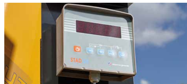
The electronic additive scales guarantee continuous mixing of the individual components.