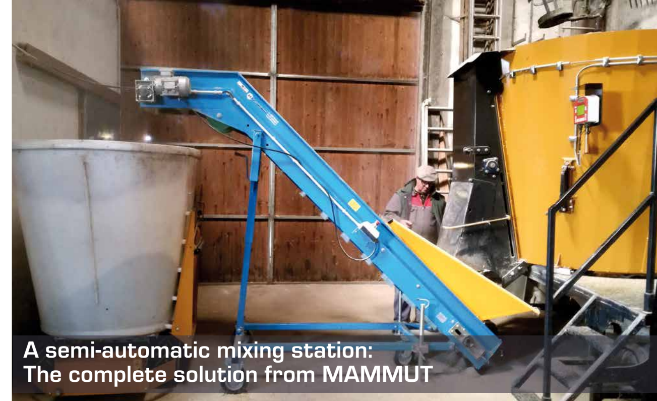
A semi-automatic mixing station: The complete solution from MAMMUT

The semi-automatic TMR station offers maximum working convenience: Combining the stationary PROFI MIX with 4 m 3 volume, a conveyor belt and the Distributor 1.5 SFB self propelled distribution wagon, this concept from MAMMUT is the most flexible feed system on the market.