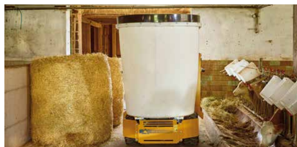
The self-propelled mixer is available with a petrol engine or electric motor, and thanks to its compact construction it is ideally suited for use in tight shed spaces.

For even greater flexibility, MAMMUT offers a self-propelled feed mixer with 2.5 m 3 volume. With its single-wheel steering and a steering lock angle of approx. 150 degrees, the slim-line mobile mixer is extremely agile. The container on the self-propelled mixer is made of plastic (polyethylene HD) – the wear-resistant material not only guarantees a long service life but also reduces the net weight of the mixer.