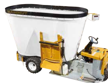
Self-propelled mixer PM 2.5 SF