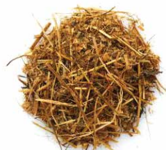
bull fattening TMR

hay corn barley soy apple pomace molasses minerals