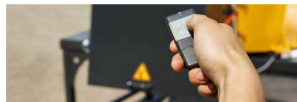
Both the discharge and the auger can be controlled by means of remote control.