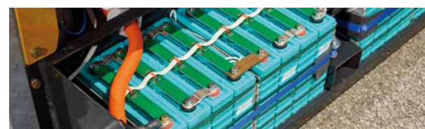
NEW: PROFI MIX 2.5 m 3 self-propelled mixer with electric motor and rechargeable battery pack.

In addition to the Honda petrol engine, the mobile mixer is also available as an electric version: This means that emission-free operation is possible, particularly in closed sheds. The PM 2.5 SF is available in mains and cordless versions.