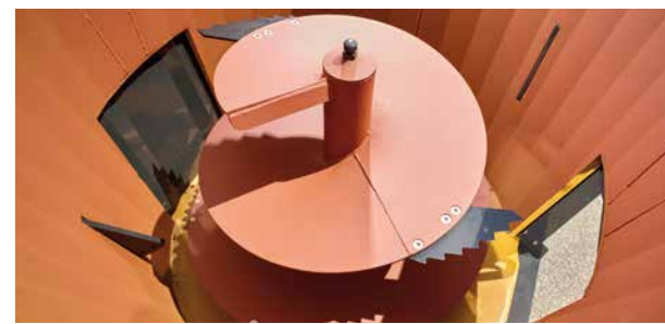
The vertical mixer auger and the canted container ensure that the feed is mixed through perfectly.

An intelligent range of accessories makes feed mixing even more simple: For example the discharge and the mixer auger can each be conveniently controlled electrically by remote control.