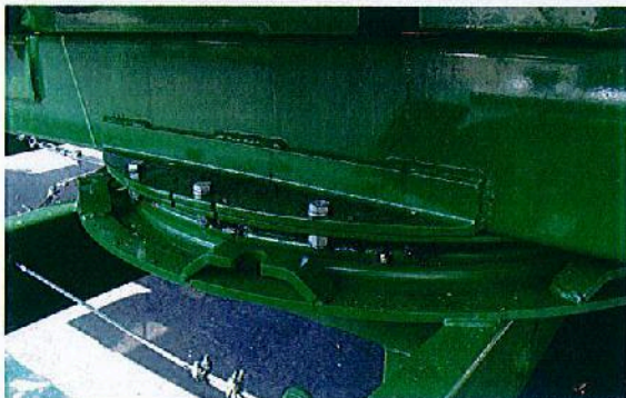
Hopper with steel loading belt sized 3000x1430x600 and hydraulic-powered feeding roller, both electronically controlled by no-stress device.

The 360° center plate allows the machine positioning while working and its correct arrangement for road transportation