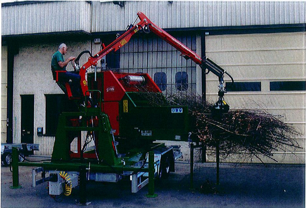
BS 760 with loading crane mounted on rotary center plate and 80 km/h tandem trailer.