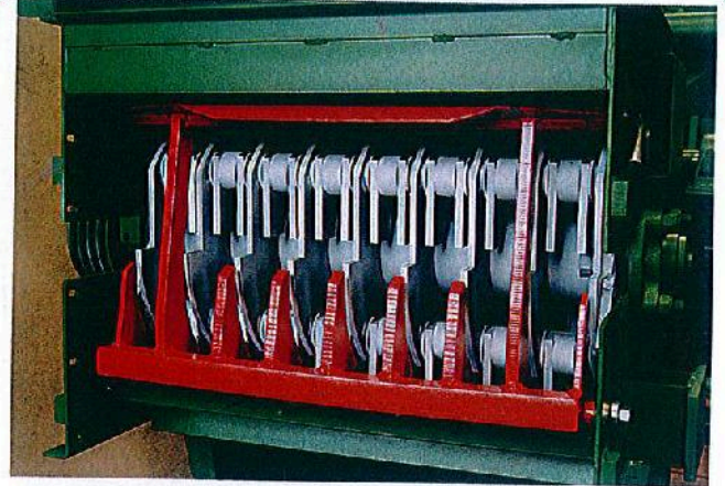
Rotor fitted with 64 hammers, 12 mm long, arranged on 4 axes and output counter-hammers. As an option, hammers 6 mm in length as well as some special counter-hammers for thin trimmings treatment are available.