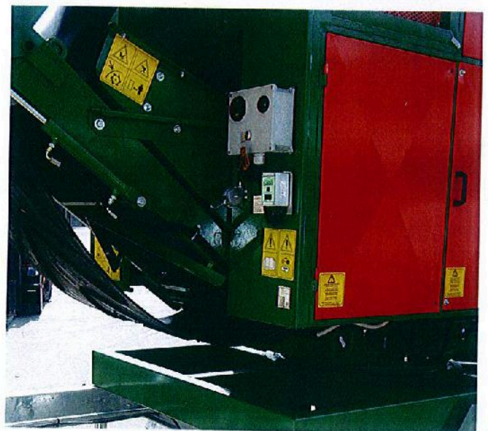
Motor control board, complete with no-stress device. As an option: electro-hydraulic controls with remote control cable.